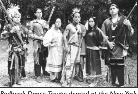
Redhawk Dance Troube danced at the New York Night festivities