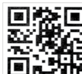
iPhone iSight Camera: Ten Tips in Ten Minutes