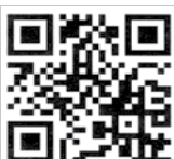
Delta Kappa Gamma Society International Resources