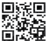
Arts & Humanities Jury Resources