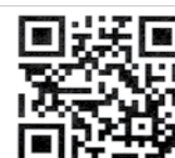
Legacy of Leadership