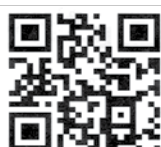
Educators Award Resources