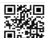
Google Me This and More