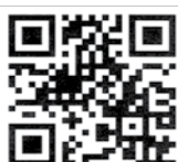
Delta Kappa Gamma Educational Foundation Resources