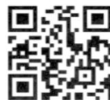
Delta Kappa Gamma Society International Applications