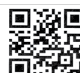
Go Ahead Tours Fall Foliage