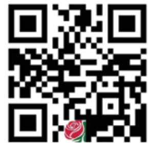
Scanning this QR code will link to the International website.