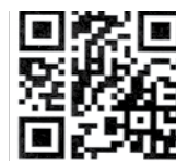
Social Media Information and Resources Guide

Download a free scanning app on your smart phone (such as ScanLife or Quick Scan). Open the app on your phone and hold the phone over any of the following QR codes. It will automatically take to you that internet site. The fourteen QR codes below help you find resources from DKG committees, boards and jury presented in breakout sessions and 10-minute Take-Aways from the Southwest Regional Conference in Hawaii.